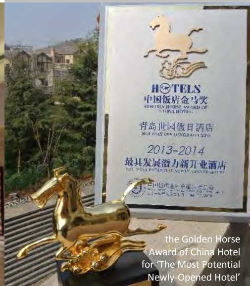
the Golden Horse Award of China Hotel for 'The Most Potential Newly-Opened Hotel'