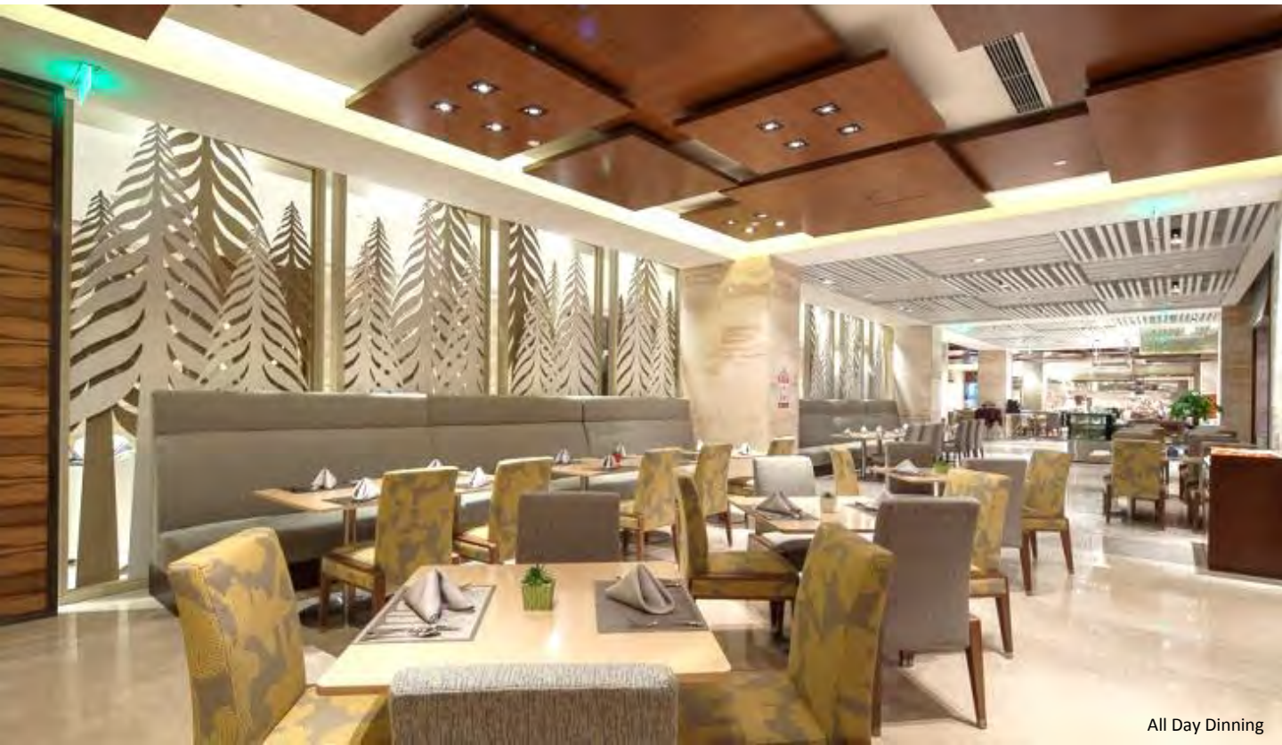
All Day Dinning